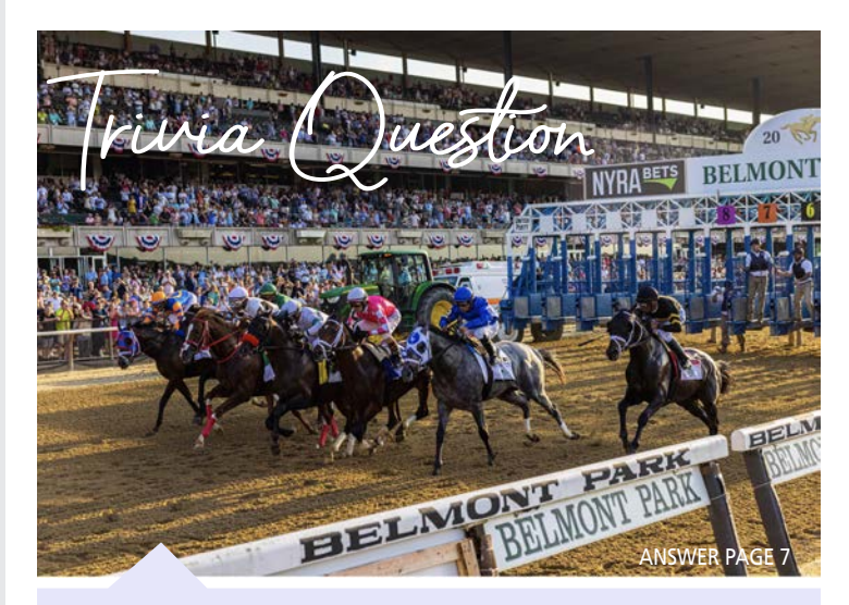
Q: Since 2000, how many horses have won the first two legs of the Triple Crown, but lost the Belmont Stakes?

We encourage you to visit our Belladonna YouTube channel frequently, as we regularly post workout and training videos of the Belladonna runners. CLICK FOR VIDEOS