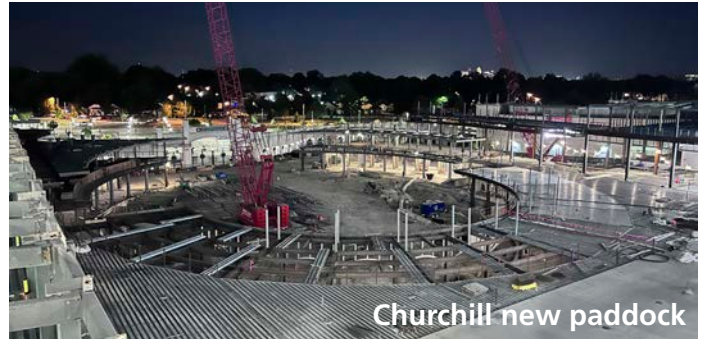
Churchill new paddock