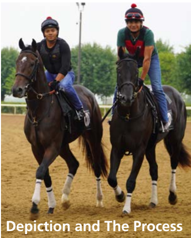
Depiction and The Process