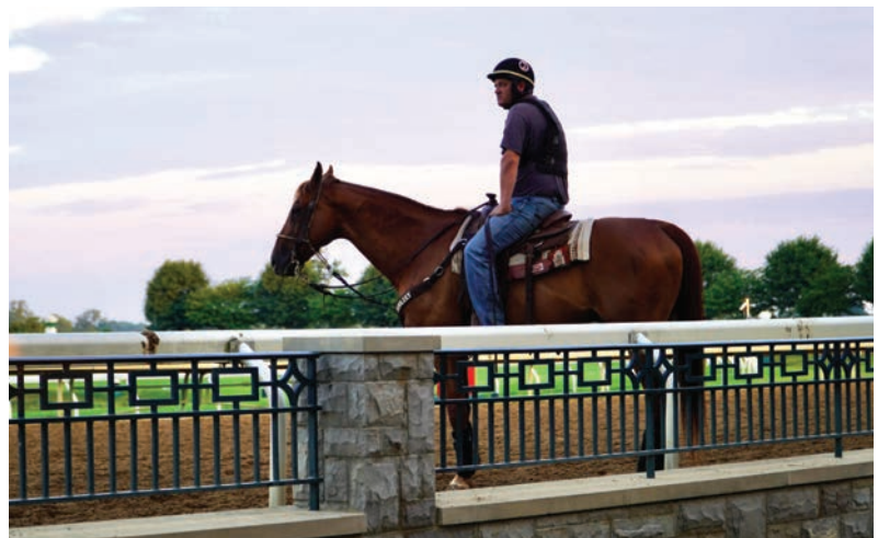
Answer: A colt by Northern Dancer out of Bubbling sold for $4.6 Million at the 1984 Saratoga yearling sale. Bought by BBA (Ireland) and named PARLANDO, he was unraced.