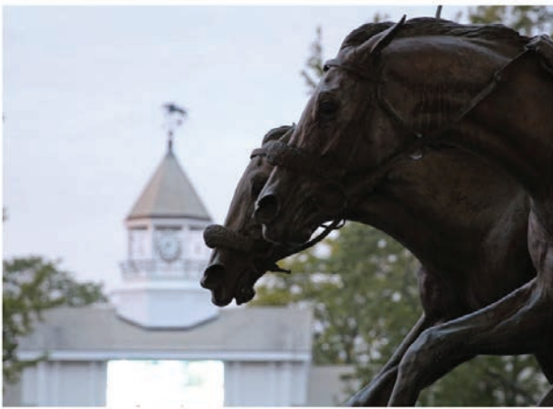
Arlington Park