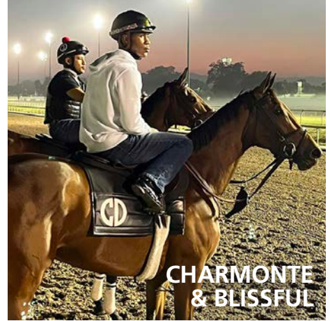
CHARMONTE & BLISSFUL