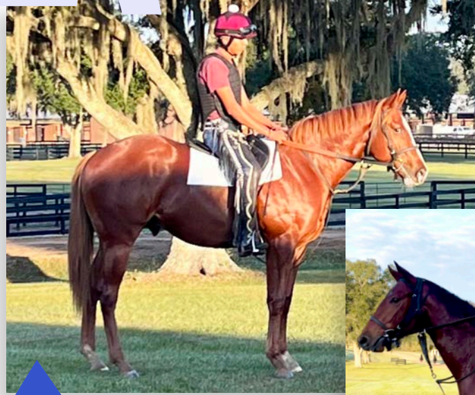
Munnings-Above the Crowd colt Upstart-Glinda filly

Our team visited the stunning facility of Eisaman Equine in Williston, Florida, recently to check on our Belladonna V yearlings. We are very happy with the progress of our babies at this early stage of learning. After four years of exclusively owning fillies, this is our first group of horses with colts added to the mix.