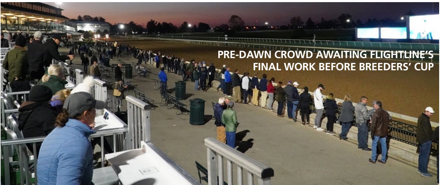
PRE-DAWN CROWD AWAITING FLIGHTLINE'S FINAL WORK BEFORE BREEDERS' CUP