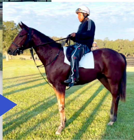
Medaglia'Oro-River Maid colt