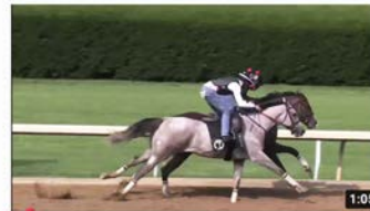
Ready to Act '20 6/25 No views · 4 hours ago