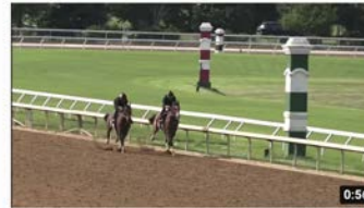
Internal Affair '20 (I)-Weight No More '20 6/25 No views · 4 hours ago