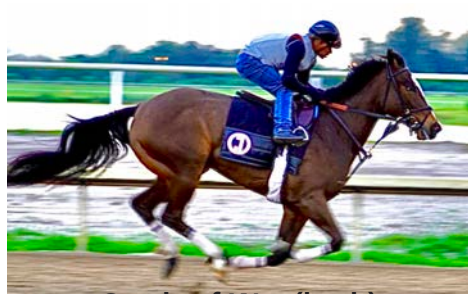
Sands of War (both)