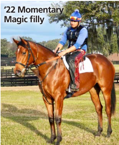
'22 Momentary Magic filly