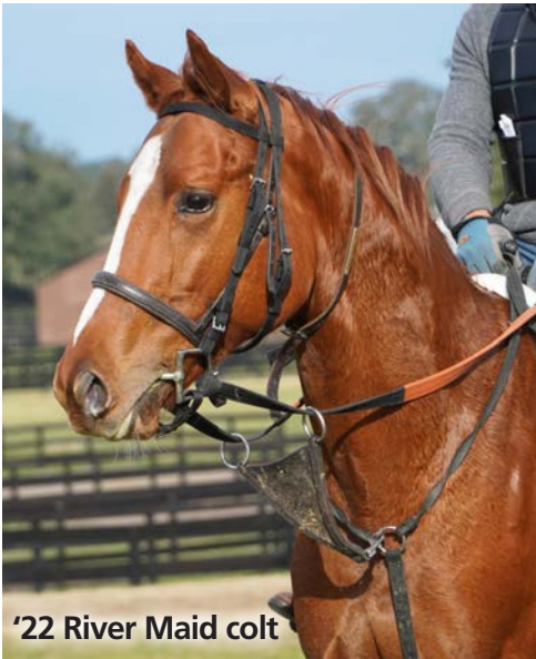
'22 River Maid colt