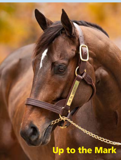
Up to the Mark

Up to the Mark is a son of up-and-coming sire Not This Time and was a $450,000 yearling. He had a tremendous turn of foot when he ran and could close quickly because of it. At the time he was purchased for stud duty, he was already a dual G1 winner at 9 and 10 furlongs. After his purchase, he won the Coolmore Mile (G1) at Keeneland and finished the year an impressive second to Auguste Rodin in the G1 Breeders' Cup Turf. He ended his career with G1 wins at 8, 9, and 10 furlongs and a second in a G1 at 12 furlongs. Even though he preferred the turf, he has a dirt pedigree (out of a Ghostzapper mare and his granddam won the G1 Test). We feel he's the type of stallion whose progeny will perform on both surfaces and fits in our roster because of that potential versatility.