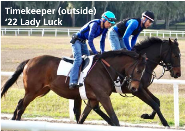
Timekeeper (outside) '22 Lady Luck