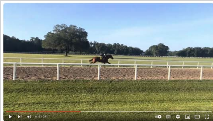
River Maid '22