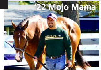
'22 Mojo Mama