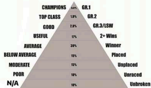
Chart showing the population of all horses by Quality classified into Graded Races

To succeed at top level, we always aim for Gr.1, Gr.2 and Gr.3 class.