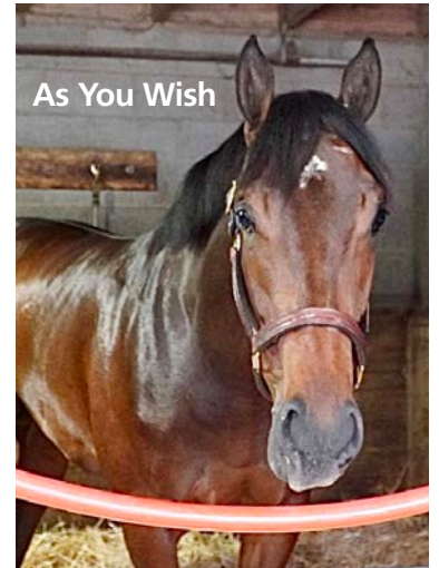
As You Wish