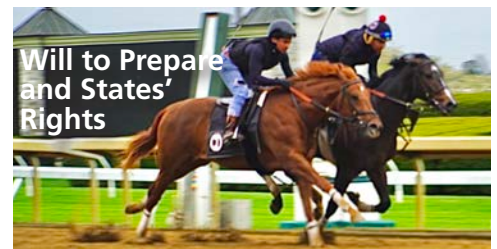
Will to Prepare and States' Rights