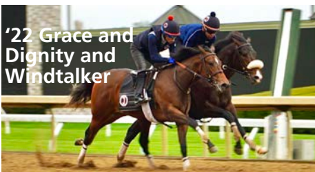
'22 Grace and Dignity and Windtalker