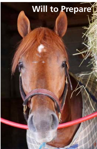
Will to Prepare