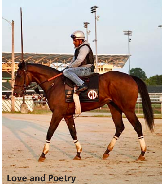
Love and Poetry