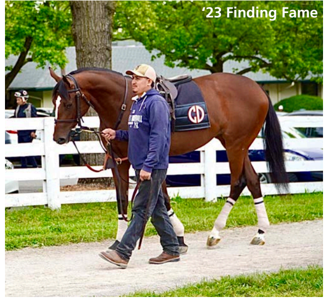
'23 Finding Fame