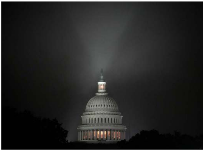
The newest spending bill could bring big tax breaks for horse owners