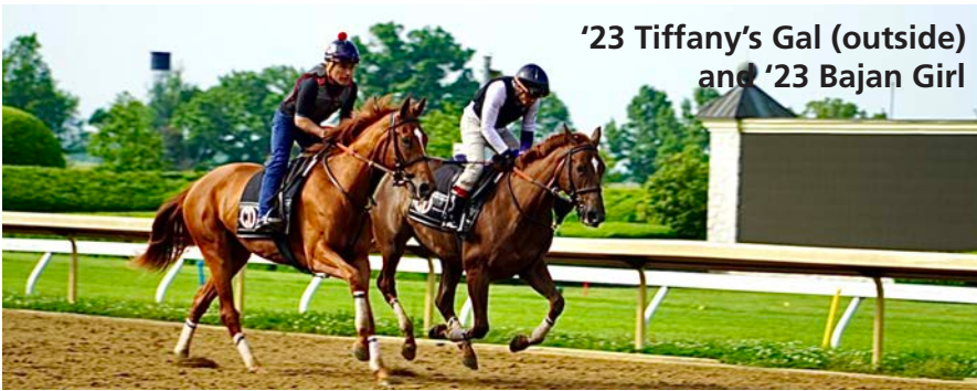
'23 Tiffany's Gal (outside) and '23 Bajan Girl