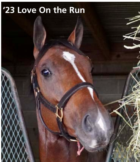
'23 Love On the Run