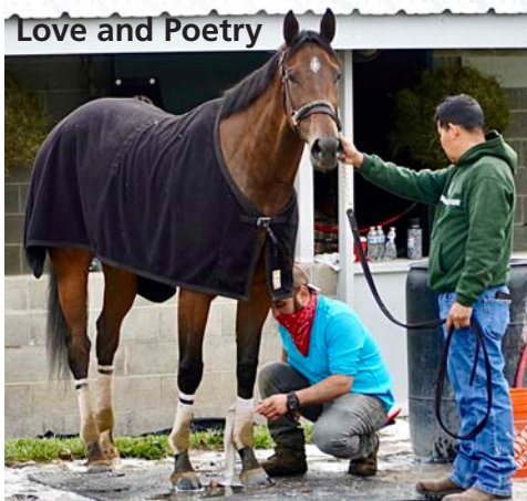
Love and Poetry