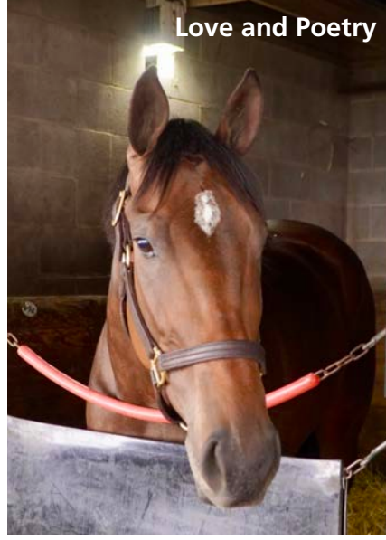
Love and Poetry