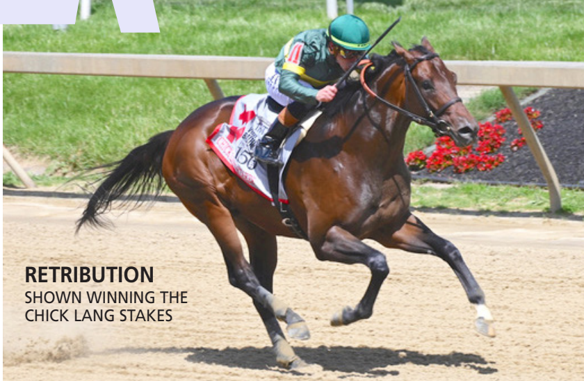
RETRIBUTION SHOWN WINNING THE CHICK LANG STAKES