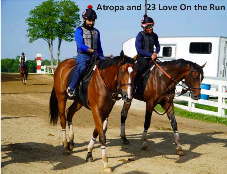
Atropa and '23 Love On the Run