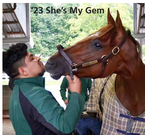
'23 She's My Gem