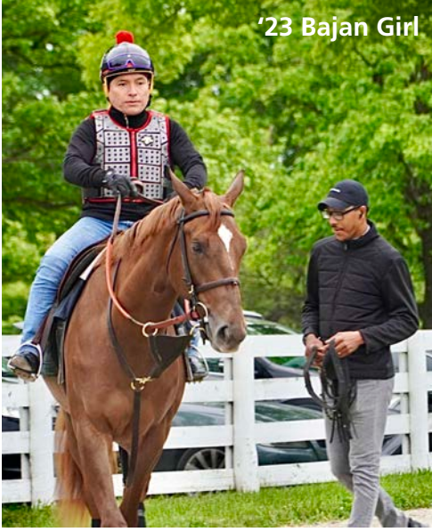
'23 Bajan Girl