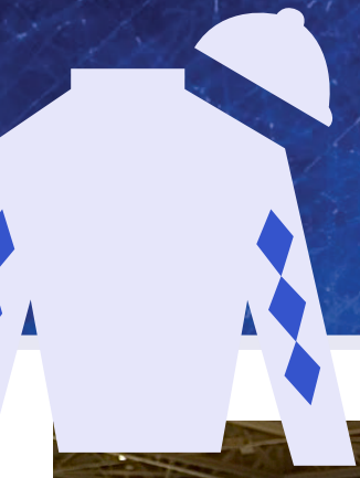
Atropa Make a Wish Day Winner's Circle